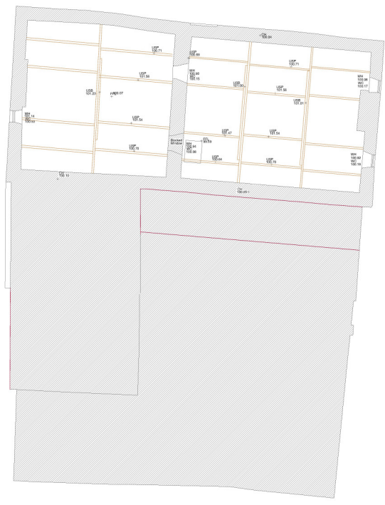
ATTIC FLOOR PLAN